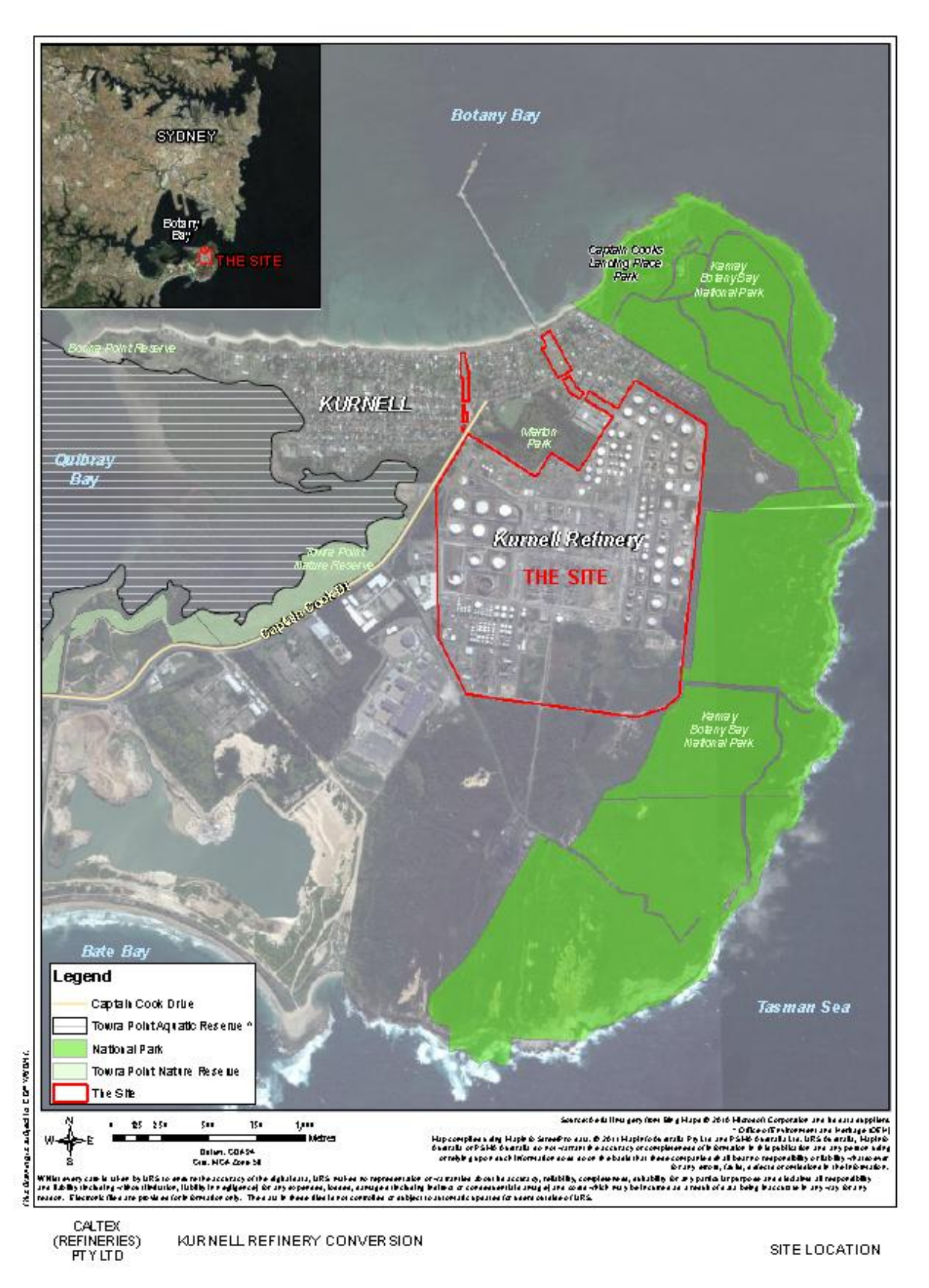
Figure 1: Site Location Caltex Kurnell Refinery.