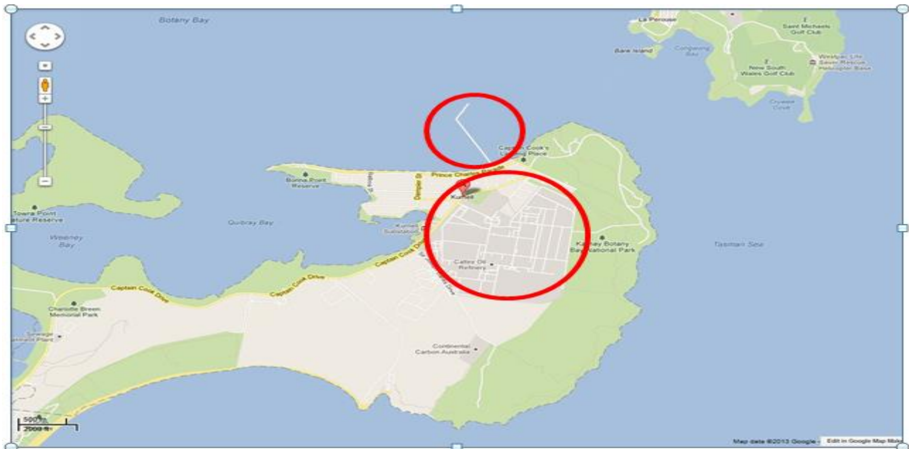
Diagram 1. Geographical Location of Ampol Kurnell Terminal Site (Land and Wharf)

Electronically Controlled Document. Refer to online document for current version.