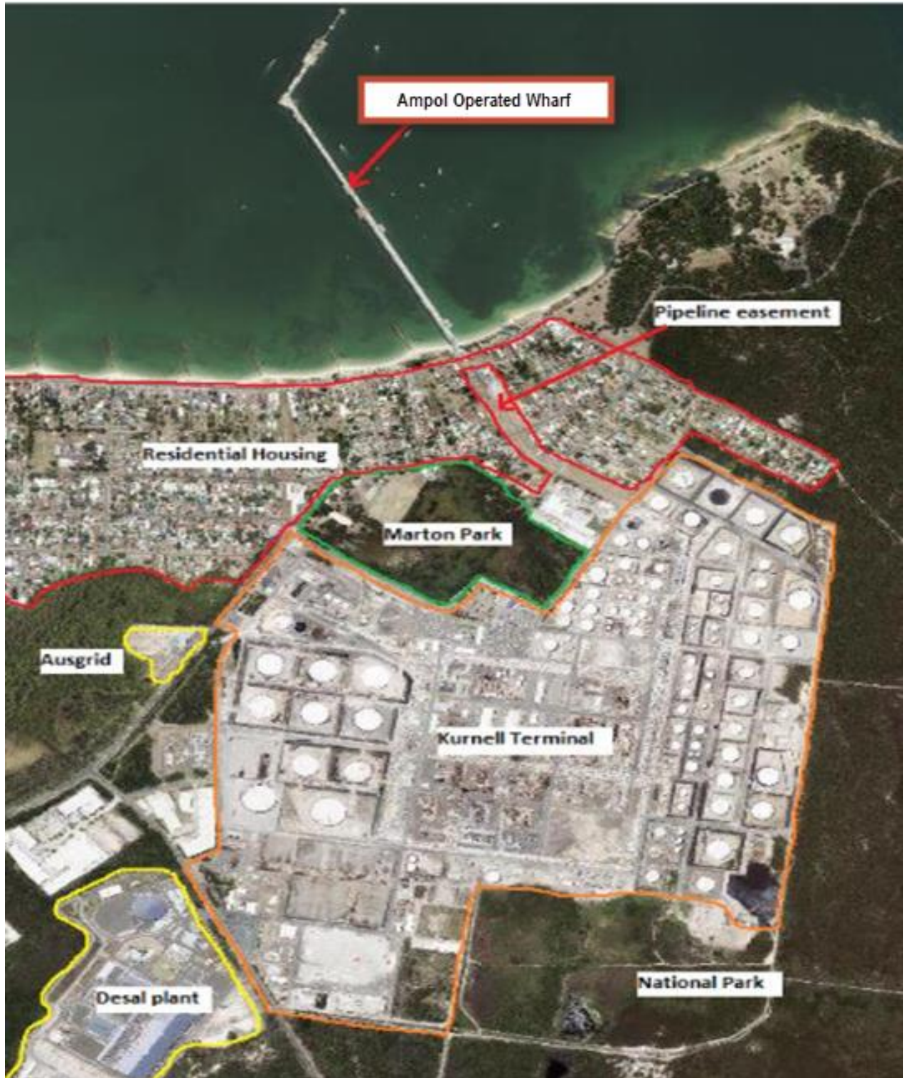
Diagram 4. Kurnell Terminal Surrounding Land Use

Electronically Controlled Document. Refer to online document for current version.