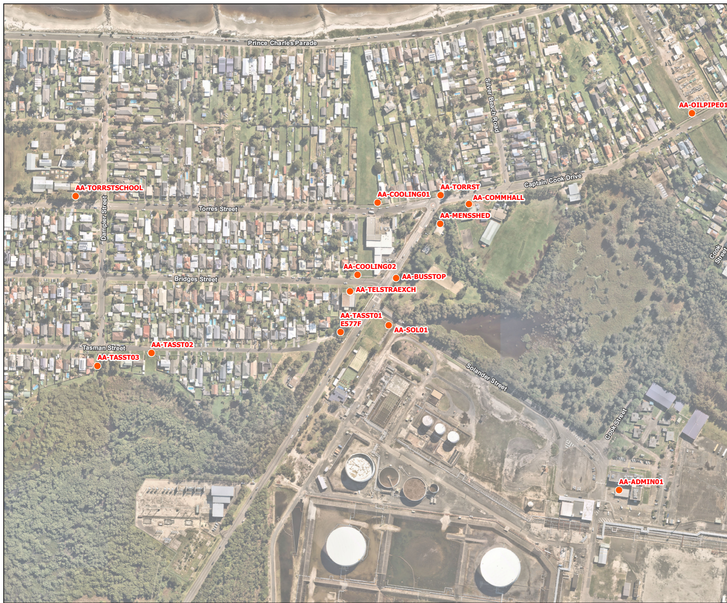
Figure 1 Ambient air quality monitoring location plan